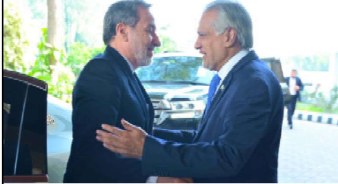
ISLAMABAD: Deputy Prime Minister and Foreign Minister Senator Mohammad Ishaq Dar welcomes Minister for Foreign Affairs of the Islamic Republic of Iran Seyyed Abbas Araghchi.

we set... and which the public rightly expects". But he said the number being sacked was also an indication of the "effective, robust procedures in place to identify and deal with these officers swiftly". Their behaviour tarnishes policing and erodes public trust," he added. In January 2023, the Met revealed that 1,071 officers in the 34,000-strong force had been under investigation for domestic abuse and violence against women and girls.