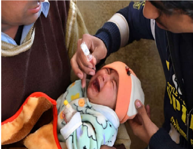
A child being administered polio drops in Quetta