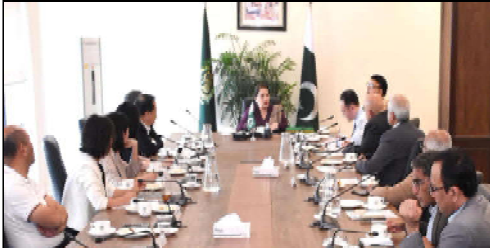
ISLAMABAD: Coordinator to Prime Minister on Climate Change Romina Khurshid Alam chairs a meeting with a high-level six member delegation of Sino-International Entrepreneurs Federation.