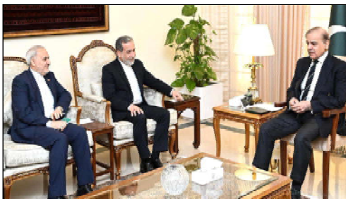
ISLAMABAD: Foreign Minister of Iran Seyyed Abbas Araghchi calls on Prime Minister Muhammad Shehbaz Sharif.

In his remarks on the occasion, the Iranian Foreign Minister appreciated Pakistan's strong and clear stance in condemning the Israeli aggression against Iran.