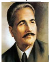
For 2024 already includes November 9 as an observance, which suggests that Iqbal Day festivi-

Iqbal Day has had an on-and-off history as a public holiday. Initially suspended in 2015, it was reintroduced in 2022, and last year, the Cabinet Division recognized it as a holiday, sparking hopes for a similar decision in 2024. The official holiday schedule