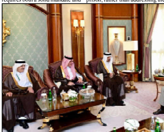
RIVADH: Saudi Investment Minister Engr. Khalid Bin Abdul Aziz Al-Falih and Advisor Royal Court Mohammed Al-Tuwaijri call on Prime Minister Muhammad Shehbaz Sharif on the sidelines of Arab-Islamic Extraordinary Summit.

Abbasi also took aim at the role of the opposition in current Pakistani politics. Criticizing PTI's approach, he argued that the party was more focused on securing the release of its leader, Imran Khan, from prison, rather than addressing the pressing issues facing the nation. "The opposition's primary goal today is not to engage with the country's problems. PTI is obsessed with getting Imran Khan out of jail, and they continue to hope for external intervention, particularly from figures like Donald Trump, to force Pakistan to release him. This is a crude illusion," he remarked. He added that the opposition should be focusing on the country's economic challenges, governance issues, and social problems, rather than fixating on the fate of one individual.