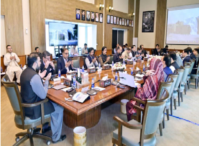
Balochistan cabinet offering fateha for the victims of Quetta Railway Station blast victims