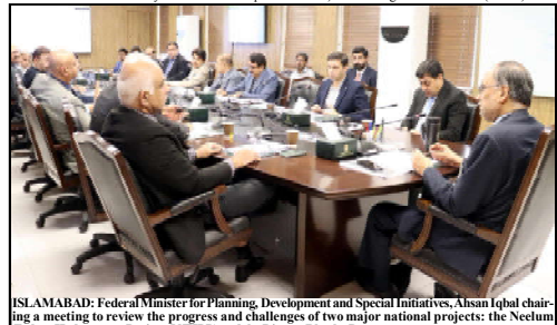
ISLAMABAD: Federal Minister for Planning, Development and Special Initiatives, Ahsan Iqbal (right) chairing a meeting to review the progress and challenges of two major national projects, the Neelum Jhelum Hydropower Project (NJHP) and the Diamer Bhasha Dam.