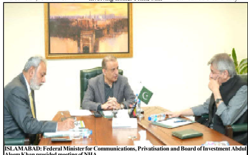
ISLAMABAD: Federal Minister for Communications, Privatisation and Board of Investment Abdul Aleem Khan presided meeting of NHA.