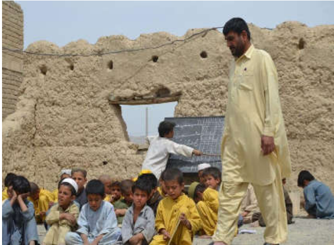
File Photo of a shelterless school in Balochistan's Killa Abdullah district: Photo by Asmat Khan Kakar