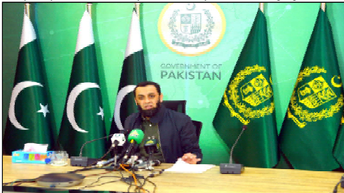
ISLAMABAD: Mr. Attaullah Tarar Federal Minister for Information, Broadcasting and National Heritage, addressed a press conference.

Pakistan has expressed keen interest in cooperation in the tractor manufacturing sector, highlighting Belarus's expertise in agricultural machinery. Several agreements are expected to be signed between the two countries, fostering collaboration across multiple sectors and paving the way for stronger economic and strategic ties, the source said.