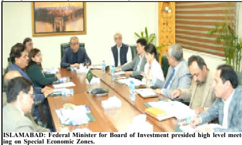
ISLAMABAD: Federal Minister for Board of Investment presided high level meeting on Special Economic Zones.

Imran Khan also took the opportunity to clarify recent statements made by his wife, Bushra Bibi, regarding the PTI's political situation. He stressed his "exemplary relations" with Saudi Arabia and explained that Saudi Crown Prince Mohammed bin Salman had reached out to him personally following the Wazirabad assassination attempt. Khan recalled that during his tenure, Saudi Arabia had played a crucial role, including hosting the OIC Foreign Ministers' Conference in Islamabad just two weeks before his government's downfall.