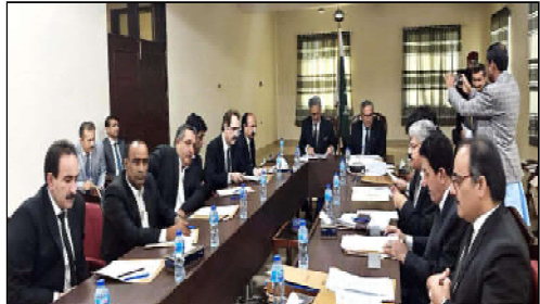
GWADAR: Chief Justice of Pakistan Justice Yahya Afridi chairing the meeting of Jail Reforms at Gwadar Balochistan.

The cases are part of ongoing legal proceedings following the protests in Islamabad, where authorities have intensified efforts to investigate and gather evidence linked to the unrest at D-Chowk.