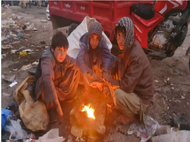
QUETTA: Burning plastic, woods to brave chilly weather in Quetta: Photo Manan Mandokhail