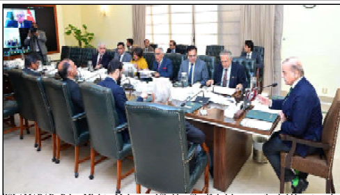
ISLAMABAD: Prime Minister Muhammad Shehbaz Sharif chairing a meeting held here to review the current situation of Syria and safe evacuation of Pakistanis present in the country.