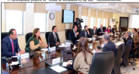
ISLAMABAD: Federal Minister for Finance and Revenue, Senator Muhammad Aurangzeb chairing the meeting of Prime Minister's Committee on Social Impact Financing.

Meanwhile, the FBR sources said that Tax-to-GDP ratio has been improved from 8.8 percent to 10.3 percent while Rs 12 billion taxes are collected from retailers in three months. They added that 400,000 new traders have filed tax returns and the number of registered traders is increased from 200,000 to 600,000.