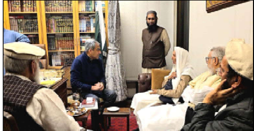
ISLAMABAD: Federal Interior Minister Mohsin Naqvi in meeting with Maulana Fazl Rahim Ashrafi, Patron-in-Chief of the Wafaq ul Madaris.