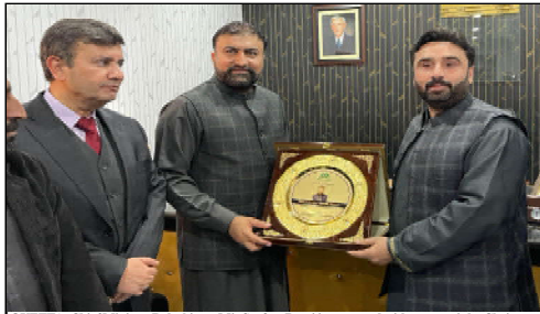
QUETTA: Chief Minister Balochistan Mir Sarfraz Bugti is presented with a souvenir by Chairman Municipal Committee Sui Izatullah Bugti.