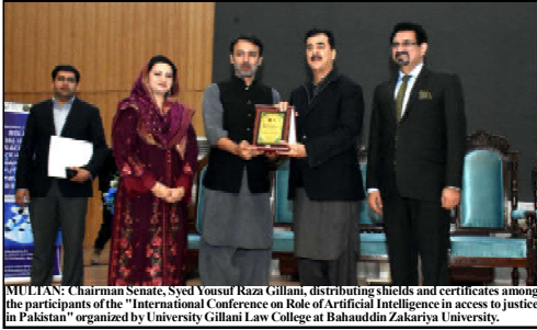
MULJANI, Chairman Senate, Syed Yousuf Raza Gillani, distributing shields and certificates among the participants of the "International Conference on Role of Artificial Intelligence in access to justice in Pakistan" organized by University Gillani Law College at Bahauddin Zakariya University.

India is changing the population ratio in occupied Kashmir-Pakistan also pledges to continue its moral, political and diplomatic support for the Kashmiris to achieve their legitimate right to self-determination. The Government of Pakistan will continue to work for justice, equality, dignity and human rights for all.