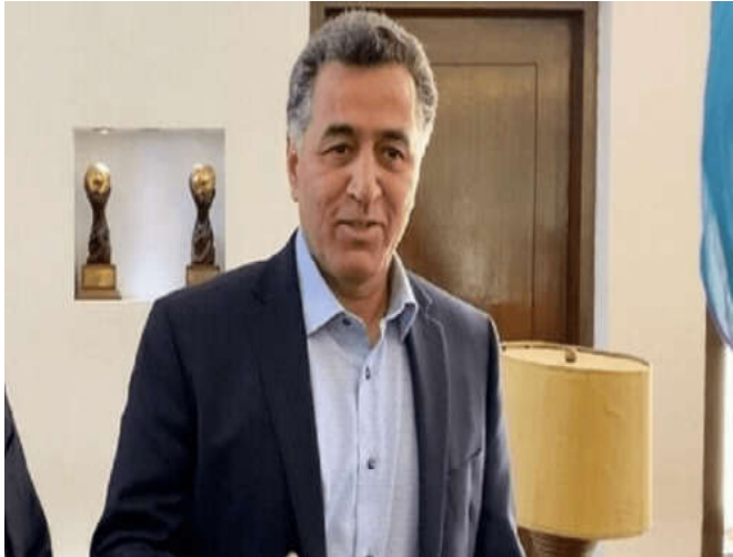
File photo of Lt General (R) Faiz Hameed