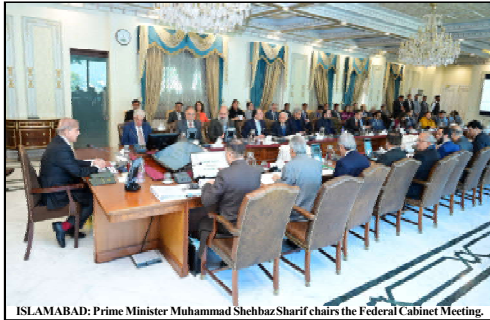
ISLAMABAD: Prime Minister Muhammad Shehbaz Sharif chairs the Federal Cabinet Meeting.