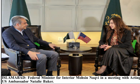
ISLAMABAD: Federal Minister for Interior Mohsin Naqvi in a meeting with Acting US Ambassador Natalie Baker.

Effective measures are essential to prevent violations of the rule of law and human rights in Pakistan. The conference strongly condemned the bloodshed and injustices nationwide, rejecting any justification for human rights violations.