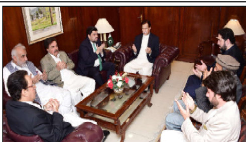
ISLAMABAD: Governor Sindh Kamran Tessori offering fatcha for the departed soul of Speaker National Assembly Sardar Ayaz Sadiq at Parliament House.

ISLAMABAD (INP): President Asif Ali Zardari has expressed his condolences over the death of a prominent leader of the Awami League party, Sheikh Mujibur Rahman, who passed away in Dhaka on Monday. Zardari said he has a long and warm relationship with the late leader and his family. He expressed his deep respect for Mujibur Rahman's role in the independence of Bangladesh and his commitment to democracy and human rights. The President also mentioned that he has been in contact with the family and will continue to support them during their period of mourning.