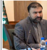
File Photo: Chief Minister Balochistan, Mir Sarfaraz Bugti chairing a meeting of the provincial cabinet.

if it benefits opponents." Deputy Commissioner Zohaib-ul-Haq assured that the recruitment process would be transparent. District Education Officers have been tasked with verifying degrees thoroughly, with immediate action against any candidate found guilty of forgery. As part of its education reform, the Balochistan government plans to reopen 3,000 schools across the province, hiring thousands of teachers on a contract basis. This initiative aims to enhance educational opportunities and improve enrollment rates, reflecting the government's commitment to merit and transparency.