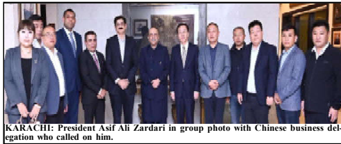
KARACHI: President Asif Ali Zardari in group photo with Chinese business delegation who called on him.