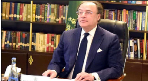
ISLAMABAD: Federal Minister for Finance and Revenue, Senator Muhammad Aurangzeb addressing virtually the inaugural session of the Second International Islamic Capital Markets Conference & Expo that opened in Karachi on Thursday.

In the first phase, 168 trainees would receive a monthly stipend of Rs 5,000 for three months with a budget of PKR 7.56 million for this phase.