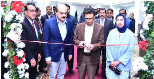
ISLAMABAD: Federal Minister of Education & Professional and Training Science & Technology Dr. Khalid Maqbool Siddiqui cutting ribbon during Pakistan Education Endowment Fund hosted the Scholarship Celebration ceremony at NELB-17.

Foreign officials are warily engaging with the former rebels, although HTS remains designated a terrorist organisation by Washington, the United Nations, EU and others. The new government must "uphold commitments to fully respect the rights of minorities, facilitate the flow of humanitarian assistance to all in need, prevent Syria from being used as a base for terrorism or posing a threat to its neighbours," US Secretary of State Antony Blinken said. UN Secretary General Antonio Guterres said: "It's our duty to do everything to support different Syrian leaders in order to make sure that they come together, they are able to guarantee a smooth transition."