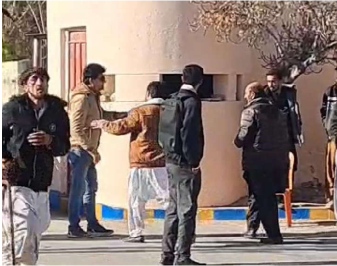
Violent clash between students and security guards at BUITEMS: Photo grabbed from a video on social media