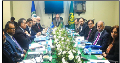
ISLAMABAD: Federal Minister for Commerce, Jam Kamal Khan, presided over the 11th Board Meeting of the Trade Development Authority of Pakistan (TDAP).