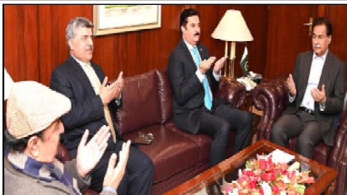
ISLAMABAD: Governor KPK Faisal Karim Kundi offering fatiha for the departed soul of sister of Speaker National Assembly Sardar Ayaz Sadiq at Parliament House.

Senior anchorperson Yasir Rehman explored the multi-dimensional aspects of the Kashmir conflict at local, national, regional, and international levels. He discussed India's propaganda efforts to polarize communities in AJK and stressed the need for economic opportunities to address grievances among AJK's youth.