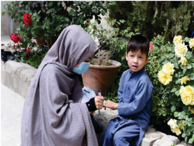
A female volunteer engaged in the provision of anti-polio drops to children in Quetta