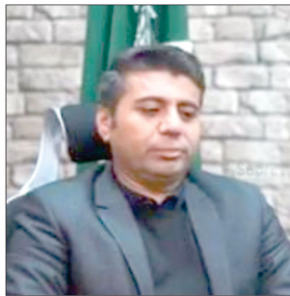
SECRETARY IRRIGATION, HAFIZ ABDUL MAJID

"The Pat-Feeder Canal remodeling is a game-changer for Balochistan's agriculture. It will ensure efficient water delivery to farmers, increasing productivity and improving livelihoods." "Our focus on expanding dam storage and building flood protection walls is vital to combating water scarcity and flood damage. These initiatives are the backbone of sustainable development." "I assure the people of Balochistan that the Irrigation Department is committed to providing long-term solutions for water management. These projects will bring stability and prosperity to our region."