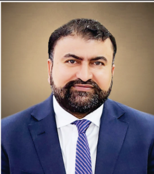
Chief Minister Balochistan, Mir Sarfraz Bugti

"The 100 Dams Project is a transformative initiative to address water scarcity in Balochistan. These dams will ensure consistent water supply for irrigation and domestic use, empowering our communities." "This project will protect our people from the devastating effects of floods while boosting agricultural productivity. It's a cornerstone of sustainable development in our province." "I fully support the efforts of the Irrigation Department in executing the 100 Dams Project. Together, we are securing the future of Balochistan with innovative water solutions."