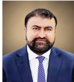
Chief Minister Balochistan, Mir Sarfraz Bugti

Transforming Water Management in Balochistan Irrigation Department's Groundbreaking Projects for a Resilient Future Boosting Dam Storage Capacity Securing Water for Future Generations: Enhanced storage ensures a consistent supply for irrigation and domestic needs. Expanding Command Areas: Addressing water scarcity with sustainable solutions. Flood Protection Walls: Safeguarding Lives and Lands Mitigating Flood Damage: Protecting communities and agricultural lands from erosion and water logging. Stabilizing the Economy: Ensuring farming sustains livelihoods during flood seasons. New Dams in Southern Balochistan: A Game-Changer Flood Control and Irrigation: Reliable water flow boosts agricultural productivity. Empowering Local Communities: Stimulating economic growth and creating jobs. Remodeling of the Pat-Feeder Canal Enhancing Water Efficiency: Supporting reliable and widespread water distribution. Empowering Farmers: Enabling effective irrigation and improving crop yields. A Vision for Sustainable Development Comprehensive Water Solutions: Addressing scarcity, flood management, and agricultural needs. Building a Resilient Future: Investments in infrastructure to uplift rural communities.