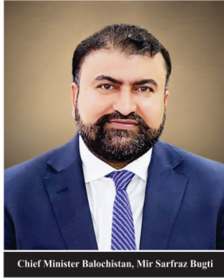
Chief Minister Balochistan, Mir Sarfraz Bugti