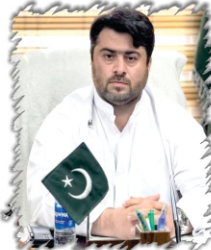
MINISTER LOCAL GOVERNMENT SARDAR KOHYAR KHAN DOMKI