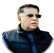
Irrigation Minister, Mir Sadiq Unrani