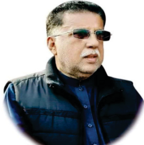
Irrigation Minister, Mir Sadiq Umrani

"The remodeling of the Pat-Feeder Canal is a monumental step toward sustainable water management in Balochistan. This project will empower our farmers with reliable irrigation, ensuring food security for future generations." "Investing in water infrastructure is investing in the future of our people. Projects like new dams and flood protection walls safeguard lives, protect farmland, and stimulate our economy." "I commend the Irrigation Department for its dedication to addressing water scarcity. Together, we are building a resilient and prosperous Balochistan for our citizens."