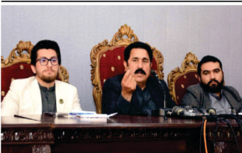
ISLAMABAD: Former Federal Minister Sajid Hussain Turf, along with former Members of the Assembly of Tribal Districts addressing a press conference on the situation in Kurram Agency at NPC.