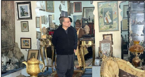
ISLAMABAD: Federal Minister for Privatization, Board of Investment and Communications Abdul Aileen Khan visited this private museum named "Sobia Mahal".

Traffic from Pehlwan Goth to the airport can use the route via Karsaz, Drig Road, Millennium, and Johar Chowringi. Traffic police have diverted traffic from Power House Chowringi to Service Road. An alternative route has been provided from Power House Chowringi to Service