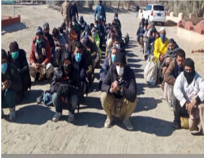
Illegal immigrants handed over at Pak Iran border Taftan: Photo Riaz Baloch