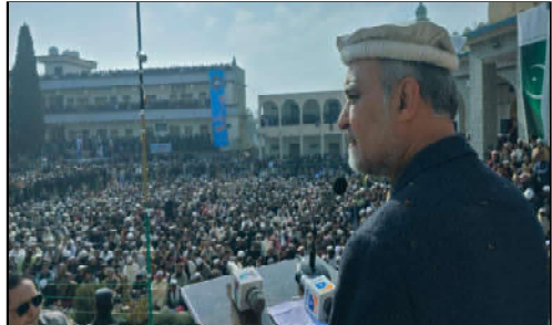
TIMERGARA: Emir Jamaat-e-Islami, Hafiz Naeem-ur-Rehman addressing a ceremony at Ihyal Uloom Balambat.