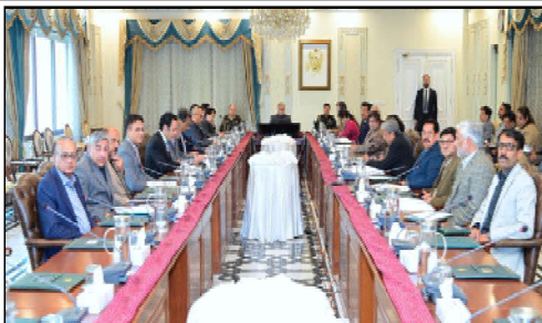
ISLAMABAD: Prime Minister Muhammad Shehbaz Sharif chairs a review meeting on performance of Electricity Distribution Companies (DISCOs).

According to details, doctors have advised Fazlur Rehman a complete bed rest and avoid walking due to swelling in his left foot, the sources said. They further say upon returning from the meeting with the prime minister last week, Maulana Fazlur Rehman experienced swelling in his left foot.