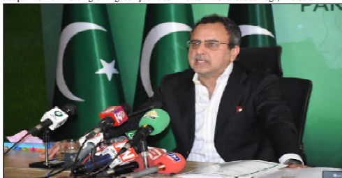
ISLAMABAD: Minister for Power Awais Leghari held a press conference on the performance of Power Division in last nine months along with major reforms and their implications.