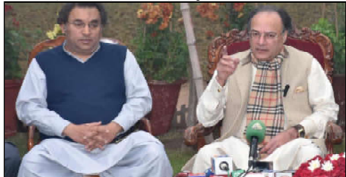
KAMALIA: Federal Minister for Finance Revenue, Senator Muhammad Aurangzeb, talking to the Media Persons during his visit to Kamalia.

While the protests have disrupted traffic for three days, we are guiding citizens on which routes are blocked and suggesting alternative paths to their destinations."