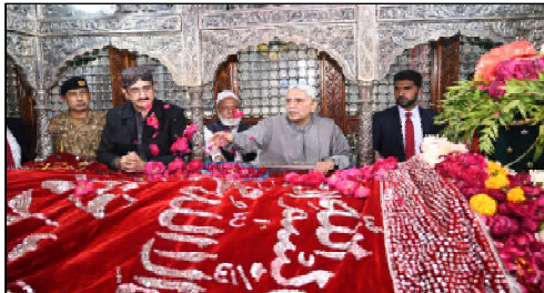
President Asif Ali Zardari offering Fataha and Showering petals at the shrine of Sakhi Ial Sheikhz Qalandar in Sehwan Sharif.