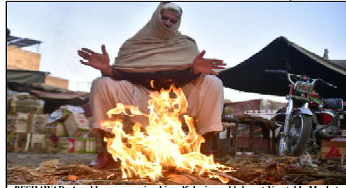
PESHAWAR: An old man warming himself during cold day at Vegetable Market.