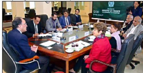
ISLAMABAD: A delegation of Population Council led by President Dr Rana Hajjeh called on Minister for Finance and Revenue Senator Muhammad Aurangzeb.

The MDCAT serves as a crucial gateway for students aspiring to join medical and dental colleges. Allegations of mismanagement have heightened anxieties among students, parents, and education stakeholders across the province. As protests continue, all eyes are on the authorities to take swift and decisive action to restore trust in the system and ensure a fair resolution for the affected students.