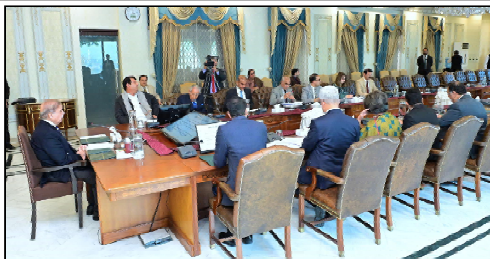
ISLAMABAD: Prime Minister Shehbaz Sharif chairs meeting on progress upon the measures taken against human trafficking.