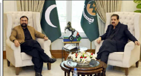
QUETTA: Provincial Agriculture Minister Mir Ali Hasan Zehri is meeting Balochistan Chief Minister Nasir Azhar Bugti.