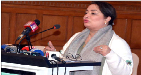
ISLAMABAD: Coordinator to PM for Climate Change, Romina Khurshid Alam addressing a seminar on "Post COP" dialogue on operationalization of article 6 the Paris agreement.

blocked due to snow, including Shogran Road, have been cleared to ensure smooth vehicular movement. The KDA has stationed additional staff and machinery at various key points to assist tourists and locals. Tourism police have been deployed in areas such as Kawai, Shogran, Paras, and Kaghan to ensure the safety and convenience of visitors. Despite the harsh weather conditions, tourists continue to flock to these scenic regions, attracted by the breathtaking snow-covered landscapes. Authorities have advised travelers to exercise caution and adhere to safety guidelines while visiting these areas.