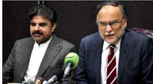
KARACHI: Federal Minister for Planning, Development and Special Initiatives Ahsan Iqbal speaks at media briefing at the Sindh Secretariat.