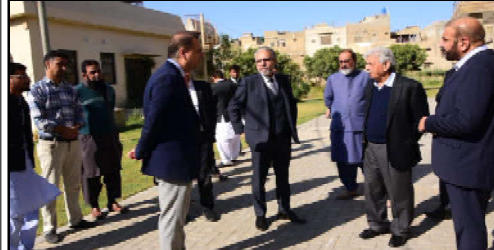
KARACHI: Federal Minister for National Food Security and Research Kana Tanveer Hussain visited the Development of Plant protection.