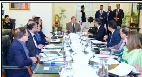
ISLAMABAD: Prime Minister Muhammad Shehbaz Sharif chairs a meeting regarding Appellate Tribunal Inland Revenue.