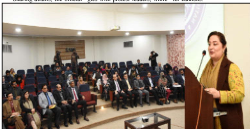
ISLAMABAD: Coordinator to PM for Climate Change, Romina Khurshid Alam addressing a seminar on "COP 29 Commitments to COP 30 Action: A Critical Analysis" at NUST.

The proposed RMP would also have, for the first time, specially trained dogs to help disperse crowds, apprehend protesters and act as deterrents to unlawful activities, as per the summary. The scheme proposed bullet-proof vehicles for the additional IG and the DIG RMP Punjab, besides 650 other vehicles, including armoured anti-riot trucks, water cannons.