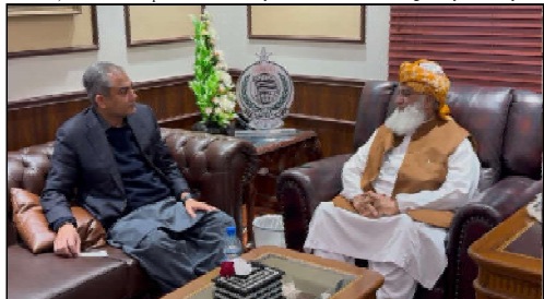
ISLAMABAD: Federal Minister for Interior Moin Naqvi in a meeting with JUI-F Chief Maulana Fazal-Ur-Rehman.

Furthermore, the Committee ratified the nomination of Senator Shahadat Awan as Member of the Board of Governors the Cannabis Control and Regulatory Authority.