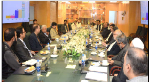
ISLAMABAD: Federal Minister for National Food Security & Research Mr. Rana Tanveer Hussain chairing a meeting with Rice Exporters Association of Pakistan (REAP) in IDAP.

In 2023, more than 1,400 people lost their lives and over 18,000 were wounded in road accidents in Karachi.