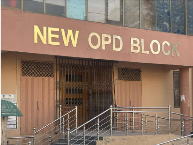
OPD of the Sandeman Provincial Hospital Quetta closed as a result of boycott by the YDA