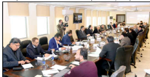
ISLAMABAD: Federal Minister for Finance and Revenue, Senator Muhammad Aurangzeb, chairing a meeting of the Economic Coordination Committee (ECC) of the Cabinet at the Finance Division.

across the country has been achieved since 2019. He said under the programme, nationwide plantation campaigns are organized every year during spring and monsoon. The Parliamentary Secretary said the government is considering establishing a new climate finance governance framework to streamline processes and improve access to climate finance. The House has now been adjourned to meet again on Monday at five pm.