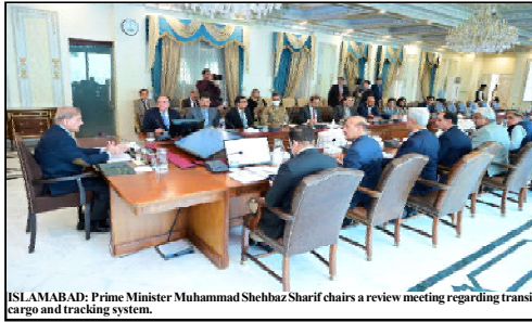
ISLAMABAD: Prime Minister Muhammad Shehbaz Sharif chairs a review meeting regarding transit cargo and tracking system.