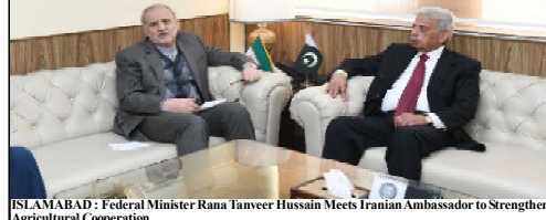
ISLAMABAD: Federal Minister Rana Tanveer Hussain Meets Iranian Ambassador to Strengthen Agricultural Cooperation.