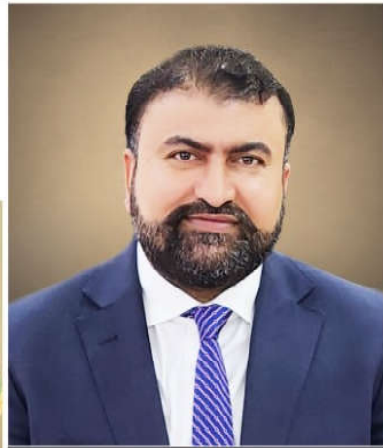
Chief Minister Balochistan, Mir Sarfraz Bugti

"Education is the cornerstone of development, and we are proud to launch transformative initiatives that empower both students and teachers in Balochistan. From teacher training to introducing smart technologies, we are equipping our schools to meet modern educational standards. The reopening of 900 schools and support for student well-being showcase our commitment to inclusive education. We believe in fostering a culture of learning that benefits not only individuals but also communities and the province as a whole. These efforts will pave the way for a progressive and educated Balochistan."