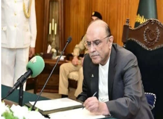
Screenshot: President Asif Ali Zardari signs Prevention of Electronic Crimes Act (Peca) bill.