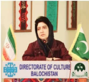
Education Minister, Rahila Hameed Khan Durrani

"The Education Department of Balochistan is dedicated to implementing sustainable reforms that enhance learning outcomes and school environments. With initiatives like financial management training for head teachers, infrastructure improvement, and assessment programs, we are raising the bar for education in the province. Our focus remains on ensuring that every child has access to quality education, supported by well-trained teachers and modern facilities. These measures reflect the government's commitment to fostering education as a means of social and economic upliftment. Education is the key to unlocking the potential of our future generations."