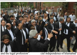
and the legal profession". The legal fraternity of Islamabad ensures its commitment to resist the unjustified transfers and appointments of judges from other provinces to the HHC, said the resolution, a copy of which is available with Dawn.com. Lawyers said that they would pursue "all legal and constitutional avenues to challenge this decision and safeguard the judicial independence of Islamabad".

According to a resolution passed in a joint session of the capital's legal fraternity today, a strike will be observed tomorrow to protest the "unconstitutional measure affecting the judiciary