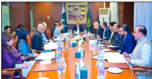
ISLAMABAD: Deputy Prime Minister and Foreign Minister Senator Mohammad Ishaq Dar chaired an Inter-Ministerial meeting to review the preparation for the second round of Pak-Qatar Bilateral Political Consultations scheduled to be held in Doha at Ministry of Foreign Affairs.