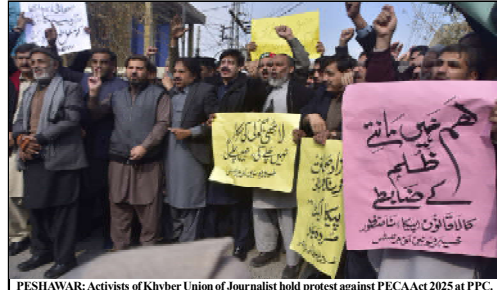
PESHAWAR: Activists of Khyber Union of Journalist hold protest against PECA Act 2025 at PPC.

It must be noted that on Friday, the Islamabad High Court (IHC) judges had written a letter to the president and prime minister in which they raised their concerns over the IHC CJ firm on the high courts. The letter also suggested that one of the three senior most IHC judges should be made the IHC CJ.