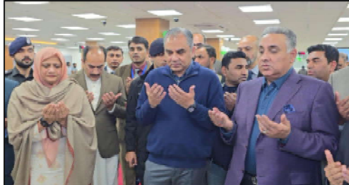
LAHORE: Federal Interior Minister Mohsin Naqvi offering dua after inaugurating new passport office at NADARA center on Peco road.

In response to a question, he revealed that major reforms are planned for the FIA, particularly in Faisalabad and Gujrat, as a large number of youth from these areas attempt to go abroad illegally. While legal migration is encouraged, he warned that illegal routes tarnish Pakistan's reputation and harm its global standing.