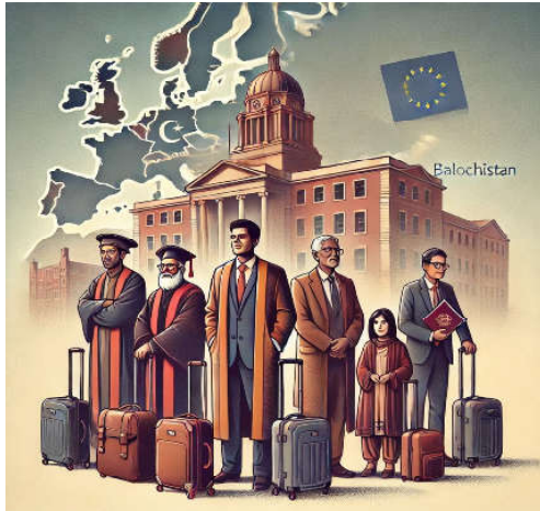
brain drain. The government's inquiry aims to introduce stricter compliance measures, ensuring future scholars fulfill their commitments to Balochistan's universities and students.

QUETTA: The Balochistan government has launched an inquiry into 50 faculty members from local universities who failed to return after completing government-sponsored advanced studies abroad. These individuals, originally part of a program aimed at enhancing academic standards at Balochistan University of Information Technology, Engineering and Management Sciences (BUIEMS), Sardar Bahadur Khan Women's University, and Balochistan University, are believed to have settled in European countries, raising concerns over the misuse of public funds. Previously, we reported on this alarming issue, highlighting the lack of proper guarantees from faculty members before their departure. Experts argue that the absence of strict agreements allowed these scholars to leave without fulfilling their obligations. A senior BUIEMS official stated, the government heavily invested in their education and travel, expecting them to contribute to our universities. Their failure to return is a major setback for our education system. Higher education plays a crucial role in nation-building and economic development, yet the province now faces a shortage of experienced faculty due to this