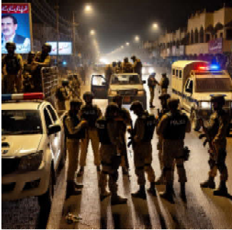
their commitment to ensuring the safety of Mastung's residents and maintaining law and order in the region.