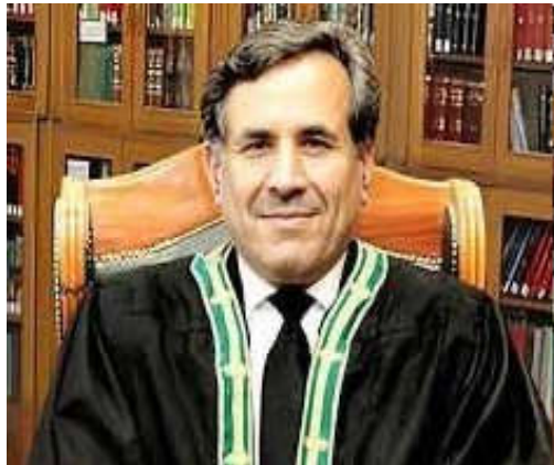
JCP are expected to have far-reaching implications for the judicial landscape in Pakistan as new appointments are made at the country's highest judicial body.