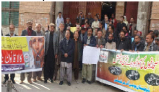
journalist was merely performing his professional duties, and his inclusion in the FIR is entirely unacceptable. BUJ has called on Chief Minister Mir Sarfaraz Bugti and the Inspector General of Police to urgently address the matter and ensure the journalist's name is promptly expunged from the case.