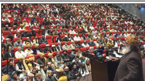
PESHAWAR: Jamiat Ulema-e-Islam-Fazil (JUI-F) Maulana Fazlur-Rehman addressing to the gathering of Mushawerti Jirga at Nishtar hall.

saying that even lawyers were facing lawsuits for defending innocent people. The PTI leader emphasised that political ideologies can vary, and politicians may cooperate with anyone. She clarified that if Maulana Fazlur Rehman or any other political party joins them, it does not mean their ideology aligns with PTI's. Political parties have different ideologies. Zartaj Gul stated that regarding a grand alliance, the entire nation must unite to support PTI. Everyone must stand with Imran Khan, as PTI is the only party firmly standing at the moment, and all political parties should support the founder of PTI. The former federal minister said that the statement, Supreme Court, and judges were being undermined, and everything was being compromised to prolong the government's party with only 17 seats. She claimed that on February 8th, their mandate was stolen.