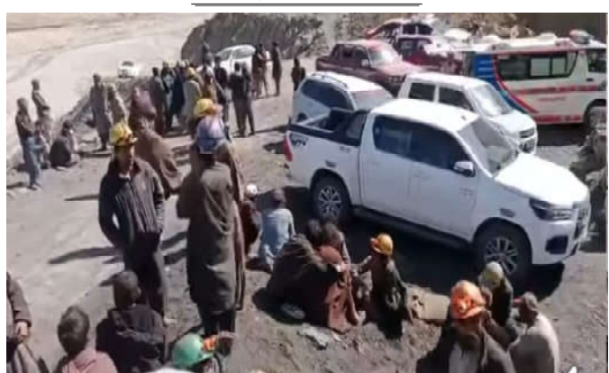
Labourers and ambulances at the spot of the tragic incident

labourers were killed and six oth-ers injured in a bomb attack tar-geting their vehicle in the Shahrag area of Harnai district, Balochistan, on Friday.