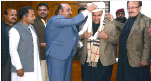
QUETTA: Supreme Court Judge Justice Hashim Khan Kakar being welcomed at the ceremony organized by Balochistan High Court Bar Association.