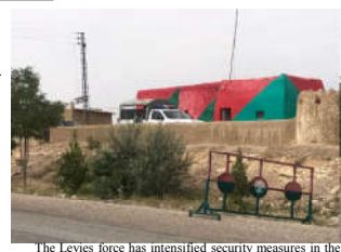
The Levies force has intensified security measures in the area as investigations continue.

Chief Minister Balochistan, Mir Sarfraz Bugti, strongly condemned the terrorist attack, expressing deep sorrow over the loss of a Levies officer. He paid tribute to the martyred official for his sacrifice and assured that those responsible would be brought to justice.