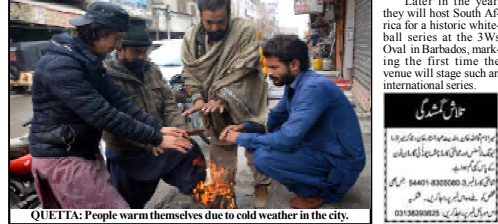
QUETTA: People warm themselves due to cold weather in the city.

and concluding in Jamaica (July 12-16). A five-match T20I series against Australia follows, with the first two games at Sabina Park (July 20, 22) and the remaining three at Warner Park, St. Kitts (July 25, 26, 28).