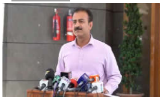
wards economic development and prosperity for the people of Sui and Balochistan.

Furthermore, PPL has committed to clearing outstanding dues of Rs. 60 billion. This agreement marks a significant step to-