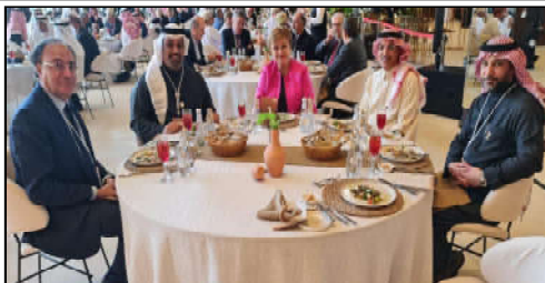
RIYADH: Finance Minister Muhammad Aurangzeb with MF Managing Director Kristalina Georgieva, Chairman of the Ahla Conference for Emerging Market Economies jointly organized by the International Monetary Fund (IMF) and the Saudi Ministry of Finance.