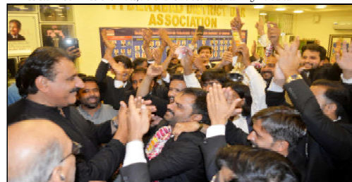
HYDERABAD: Lawyers celebrate after the wining in District Bar Council Election.

The deadly attack targeted coal miners in the conflict-hit province of Balochistan, raising security concerns for laborers working in the area.