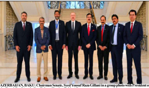
AZERBAIJAN, BAKU: Chairman Senate, Syed Yousuf Raza Gillani in a group photo with President of the Republic of Azerbaijan Ilham Heydar Oglu Aliyev.