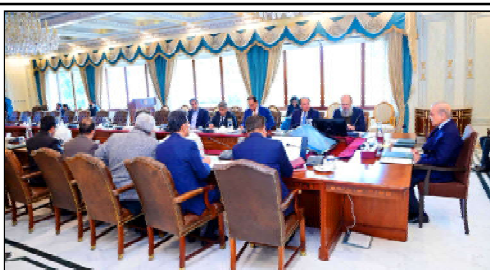
ISLAMABAD: Prime Minister Muhammad Shehbaz Sharif chairs a meeting regarding Exports Development Roadmap.

checks from 4 to 8. According to details, check-in counters will rise from 25 to 67, customs inspection points from 12 to 24, passenger boarding bridges from 4 to 6, and baggage conveyor belts from 2 to 6. Once completed, a CCECC official said, the terminal will be able to handle over 12 million passengers annually, significantly easing congestion and reducing long wait times. The official added that the terminal expansion plan aims to accommodate rising travel demand for the next 15 to 20 years, according to a report published news Gwadar Pro on Thursday.