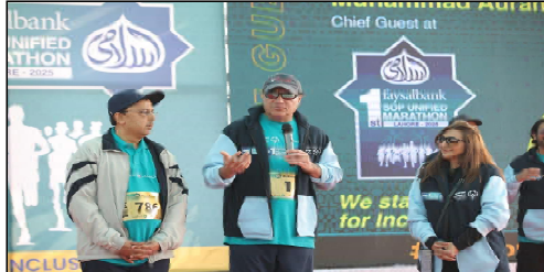
LAHORE: Federal Minister for Finance and Revenue, Senator Muhammad Aurangzeb, addresses the audience at the 1st Faysal Bank SOP Unified Marathon Lahore, 2025, highlighting the importance of inclusivity and support for athletes with special needs.

local authorities have vowed to implement stricter safety measures to ensure visitor security at upcoming gatherings. Stay tuned for more updates on this developing story.