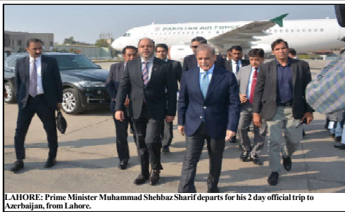
LAHORE: Prime Minister Muhammad Shehbaz Sharif departs for his 2-day official trip to Azerbaijan, from Lahore.