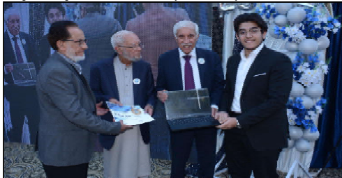
FAISALABAD: Federal Minister for Maritime Affairs, Qaiser Ahmad Shaikh, awarding the Laptop to the brilliant students during the 25 years celebration of chinist islamia school college Faisalabad.

Earlier, the President was briefed about the aims and objectives of the Workshop. It was informed that the Workshop provided a platform to share Pakistan's perspective on diverse global issues and promote dialogue with the world.