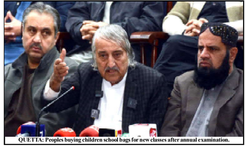
QUETTA: Peoples buying children school bags for new classes after annual examination.

Some plain areas of Khyber Pakhtunkhwa, Punjab, and Islamabad may witness hailstorms.