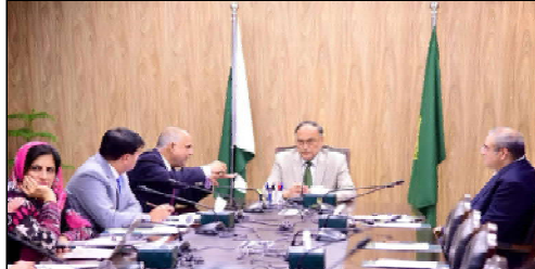
ISLAMABAD: High-level meeting was held under the chairmanship of Prof. Ahsan Iqbal, Minister for Planning, Development & Special Initiatives (PD&SI), to discuss initiatives aimed at fostering data-driven learning and informed decision-making among the youth and establishment of 'First-ever Data Park' in Pakistan.

These developments signal ongoing efforts to address the political challenges facing Pakistan and promote constitutional governance as a cornerstone of democratic restoration.