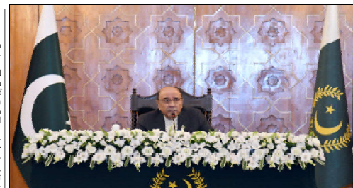
ISLAMABAD: President Asif Ali Zardari addressing the participants of the 5th International Workshop for Leadership & Stability organized by the National Defence University (NDU), at Aitane-e-Sade.