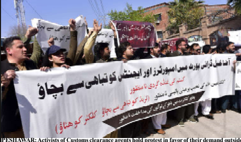
PESHAWAR: Activists of Customs clearance agents hold protest in favor of their demand outside Peshawar Press Club (PPC).

Ukraine with Javelin antitank missiles that Ukraine used to deadly effect against Russian tanks in the first wave of the 2022 invasion. Calling the Friday meeting between Trump and Zelenskyy "unfortunate," Rutte said he "knew as a fact that the American administration is extremely invested in making sure that Ukraine gets to a durable peace" with Russia. Rutte said he expected European leaders, who were meeting in London on Sunday, to help secure a future peace deal by providing Ukraine with security guarantees.