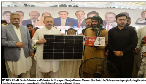
HYDERABAD: Senior Minister and Minister for Transport Sharjeel Inaam Memon distributed the Solar system to people during the Solar distribution ceremony, organized by Sindh Solar Energy at Rawal House.

On the other hand, Sui Southern Gas Company (SSGC) failed to fulfill its promise of the provision of gas to consumers in Karachi during Shri, as there was no supply of gas at the time of the first Shri of the holy month of Ramadan in the Old City area of the provincial capital, prompting the people to use LPG cylinders instead.