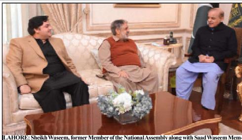
LAHORE: Sheikh Waseem, former Member of the National Assembly along with Saad Waseem Member of the National Assembly call on Prime Minister Muhammad Shehbaz Sharif.