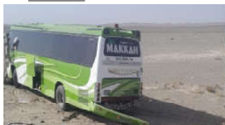
Their bodies were shifted to Nokkundi Hospital, while local authorities have launched an investigation into the incident.