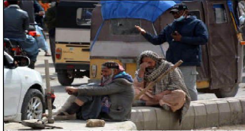
QUETTA: Daily wages workers waiting for work on the first day of Ramadan at Bacha Khan Chowk.

The initiative has been welcomed by residents, who appreciate the effort to provide relief during a time when food prices often rise. The DC of Islamabad emphasized that the primary goal is to ensure that all citizens, regardless of their financial situation, can observe Ramazan with dignity and ease.