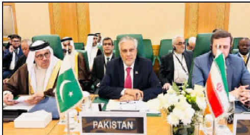
JEDDAH: Deputy Prime Minister and Foreign Minister Senator Muhammad Ishaq delivers statement at the Extraordinary Meeting of Council of Foreign Ministers of the Organization of Islamic Countries held in Jeddah.