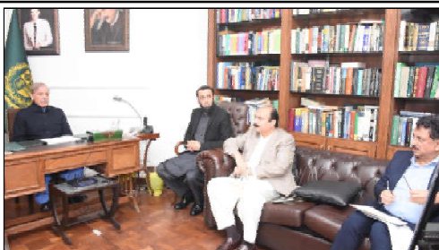
LAHORE: Prime Minister Muhammad Shehbaz Sharif chairs a meeting with regard to training of Pakistani Youth in field of digital technologies by Huawei Technologies.