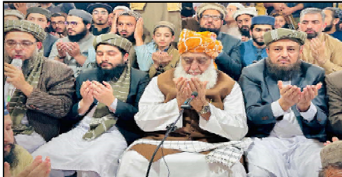
NEWSHERA: JUI chief Maulana Fazlur Rehman offering Fatiha during his condolence visit to Jamia Haqqania, Akora Khattak.

to the media, the governor said he would continue to raise his voice for the issues being faced by the people. He also directed the Dumper Association office-bearers to sell their houses and dumpers to give Rs10 million to each affected family. Tessori further said that injustices were being done to the people of Karachi. "Don't force