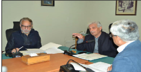
LAHORE: Federal Minister for National Food Security & Research, Rana Farveer Hussain, Chairs High-Level Meeting on PASSCO Operations in Lahore.

that sufficient time had already been granted for their dignified return. "It is emphasised that no one will be maltreated during the repatriation process and arrangements for food and healthcare for returning foreigners have also been put in place." "Pakistan has been a gracious host and continues to fulfill its commitments and obligations as a responsible state. It is reiterated that individuals staying in Pakistan will have to fulfill all legal formalities and abide by Pakistan's constitution," it said. Over 80,000 Afghans living in Pakistan illegally were repatriated to their country since Pakistan launched the campaign in November 2023. It is estimated that around 3 million Afghans still reside in Pakistan.