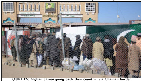
QUETTA: Afghan citizen going back their country via Chaman border.

She reaffirmed the Punjab government's commitment to maximum facilities to women with more initiatives on the way to ensure their safety and empowerment.