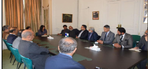
FRANCE: Ambassador Muntaz Zabra Baloch interacted with a cross section of Pakistani origin French businessmen at the Embassy of Pakistan. The discussions focussed on bilateral trade and investment between Pakistan and France. Ambassador encouraged them to invest in Pakistan and assured full cooperation of the Embassy.

also called on the government to engage with relevant stakeholders, including traders and industry representatives, to devise a balanced and comprehensive energy policy. Such a policy, they emphasized, should encourage the growth of renewable energy while safeguarding the interests of all power consumers.