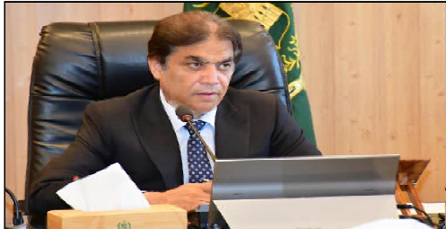
ISLAMABAD: Federal Minister for Railways Hanif Abbasi Announces Special Eid Trains on the Directives of Prime Minister of Pakistan Mian Muhammad Shehbaz Sharif.