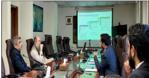
Islamabad: Federal Minister for Commerce Reviews Strategy to Boost Textile Exports as Apparel Shipments Surge 19% to $6.2 Billion.

Advocate Parvaiz sharply criticized India, which touts itself as the world's largest democracy, for failing to address the concerns raised by the UN High Commissioner regarding the rights of these defenders.