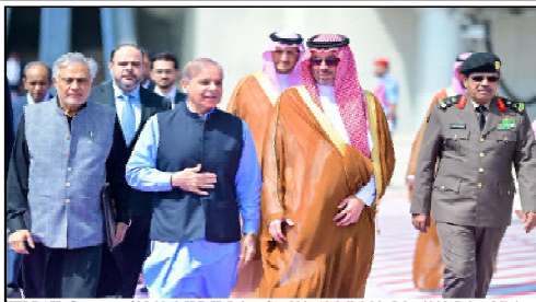
JEDDAH: Governor of Makkah H.R.H. Prince Saud bin Abdullah bin Jalawi bids Prime Minister Muhammad Shehbaz Sharif farewell after the completion of his visit to Saudi Arabia.