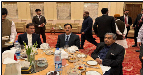
LAHORE: Chairman Senate Syed Yousaf Raza Gilani and Speaker National Assembly Sardar Ayaz Sadiq and other dignitaries at the Iftar dinner hosted by Habib Rafiq Group at a private hotel