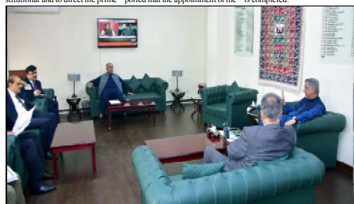
ISLAMABAD: An Important Meeting Under the chairmanship of Federal Minister for Law and Justice Senator Azam Nazeer Tarar Held Regarding the Legal Framework of Danish.

The opposition leader will have to approach the prime minister on the nomination issue because the current chief ministers have constitutional protection until the appointment process is completed.