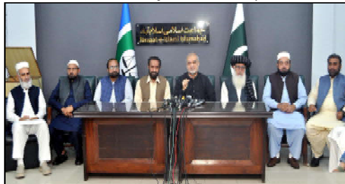
ISLAMABAD: Jamaat-e-Islami Pakistan Ameer Hafiz Naeem Ur Rehman addressing a press conference.

WAPDA restored a limit of 500 cusec of water to all those areas that were affected by flooding.