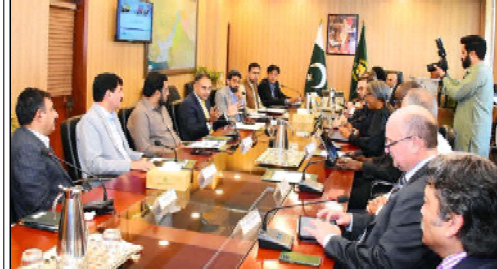
ISLAMABAD: Minister of State for Railways Bilal Azhar Kayani Tuesday held a meeting with a high-level delegation of the International Finance Corporation.

The Standing Committee has approved the Punjab Acid Control Act 2025, which will now be presented for final approval in the ongoing session of the Punjab Assembly. Once passed, the Home Department Punjab will implement the law throughout the province.