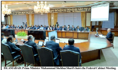
ISLAMABAD: Prime Minister Muhammad Shehbaz Sharif chairs the Federal Cabinet Meeting.

On the last Friday, a coalition of 16 university associations formally requested clarity from the Departments of Homeland Security and State, after receiving uncoordinated notices asking some students to "self-deport."