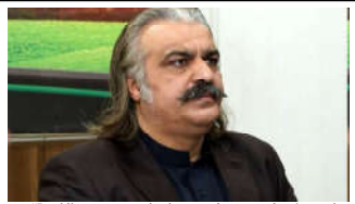
"Presiding over a meeting in

"Presiding over a meeting in Peshawar, he directed measures to enhance teachers' capacity, ensure 100 per cent merit in new