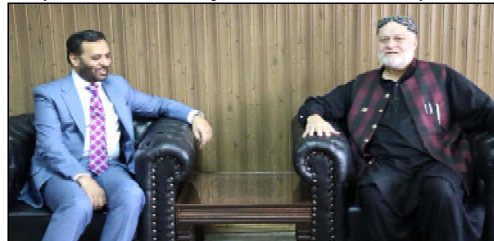
ISLAMABAD: Federal Minister for Health Mustafa Kamal called Federal Minister for Poverty Alleviation and Social Safety, Syed Imran Ahmed Shah.

He concluded by asserting, "India can no longer even think of launching another attack on Pakistan. The entire nation stands united against the enemy."