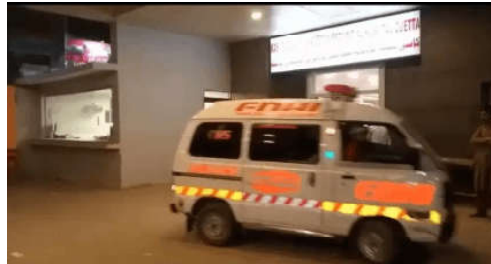
tal killing of four labourers in

Earlier, whenever a judge wanted to withdraw himself from the bench, he issued a dissenting note even when the case had just begun. This created the perception of a widening division among the judges whereas his or her dissenting views were made public by uploading the same by the IT division, thus prejudicing the case from the beginning. This happened