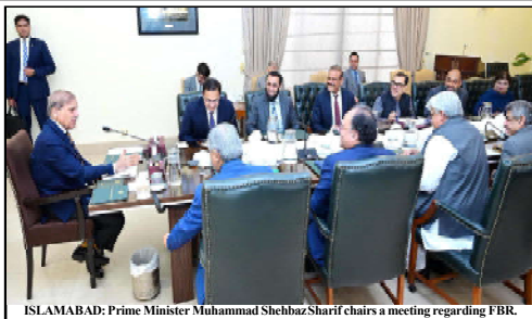
ISLAMABAD: Prime Minister Muhammad Shehbaz Sharif chairs a meeting regarding FBR.