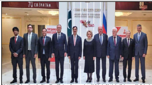
MASK OW: Chairman Senate Syed Yousaf Raza Gilani poses for a group photo with Valentina Matvienko, Chairperson of the Federation Council of the Russian Federation, during his official visit to Moscow, Russia.