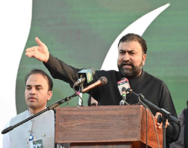
recently, I see a similar end for such so-called movements in Balochistan." He invited misguided individuals to abandon the path of violence and join the national

dressed the internal situation in into a senseless conflict. "The to be imposed through vio-Balochistan, criticizing elements people of Balochistan have de-trying to drage the Baloch neople cided not to allow any ideology movement in Kurdistan ended