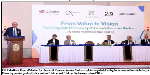
ISLAMABAD: Federal Minister for Finance & Revenue, Senator Muhammad Aramzeb delivering the keynote address at the Impact Financing event organized by Karimnagar Pakistan and Pakistan Banks Association (PBA).

The legislation was referred to the concerned standing committee, which will present its report within two months.