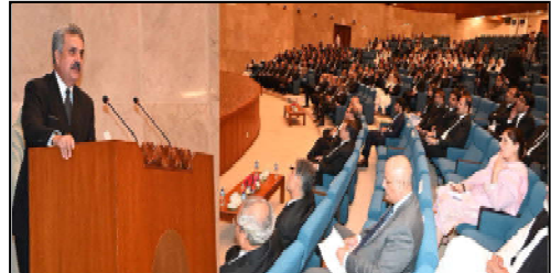
ISLAMABAD: The Hon'ble Chief Justice of Pakistan Mr. Justice Yahya Afridi delivering the concluding remarks at the Symposium "Use of Technology in Judicial System in Pakistan: Prospect and Promises" held at the Supreme Court of Pakistan.