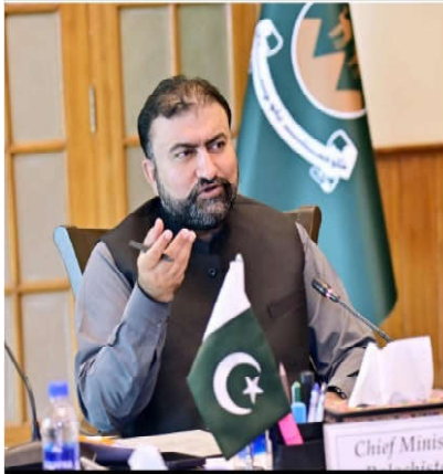
Chief Minister Balochistan, Mir Sarfraz Bugti

Under the special directive of Chief Minister Mir Sarfraz Bugti, The Quetta Beautification Project is reshaping the city's identity. Public spaces, roads, and parks are being uplifted to modern standards.