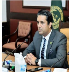
Commissioner Quetta M Hamza Shafqaat

Under the special directive of Chief Minister Mir Sarfraz Bugti, The Quetta Beautification Project is reshaping the city's identity. Public spaces, roads, and parks are being uplifted to modern standards.