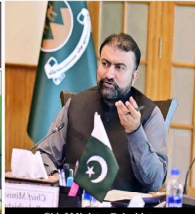
Chief Minister Balochistan, Mir Sarfraz Bugti