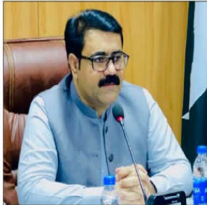
Bakht Muhammad Kakar Minister Health