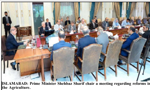
ISLAMABAD: Prime Minister Shehbaz Sharif chair a meeting regarding reforms in the Agriculture.

He called for early implementation of the Memorandums of Understanding (MoUs) signed between the two countries, and reiterated Pakistan's desire to further enhance its fraternal ties with the Kingdom.