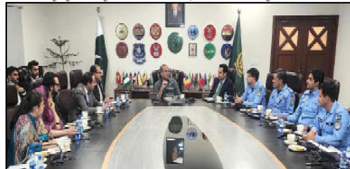
ISLAMABAD: Federal Interior Minister Mohsin Naqvi chairing a meeting regarding arrangement during Muharram.

The Supreme Court Karachi Registry confirmed that the constitutional matter will be adjudicated by the principal bench in Islamabad.