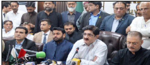
HYDERABAD: Chief Minister Sindh Syed Murad Ali Shah addressing a press conference at Mayor office.

The ECP has also announced election on the Senate seat vacated by Pakistan Tehreek-e-Insaf's Sania Nishtar.