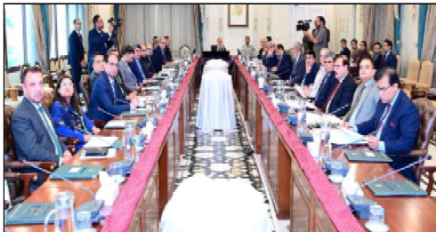
ISLAMABAD: Prime Minister Muhammad Shehbaz Sharif chairs a meeting regarding PSDP projects.