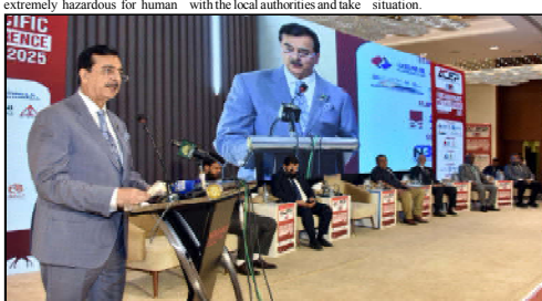
ISLAMABAD: Chairman Senate, Syed Yousuf Raza Gillani addressing as Chief Guest at closing ceremony of (FIDIC) Asia Pacific mid-year conference 2025