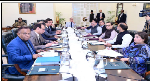
ISLAMABAD: Prime Minister Muhammad Shehbaz Sharif chairs a meeting on encouraging usage of electric vehicles in country.