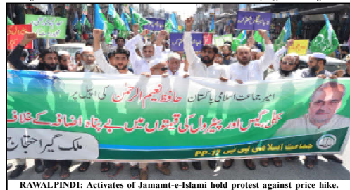
RAWALPINDI: Activates of Jammat-e-Islami hold protest against price hike.

The technology can be tried in Pakistan's arid zones, he stated, noting that Pakistan's agricultural zones are suitable for this type of farming.