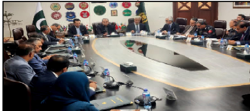
ISLAMABAD: Federal Minister for Interior Mobsin Naqvi chairing a high-level meeting.

They said that the day had also assumed great significance in the history of Kashmir because the historic resolution was adopted a month before the creation of Pakistan and India under the Partition Plan.