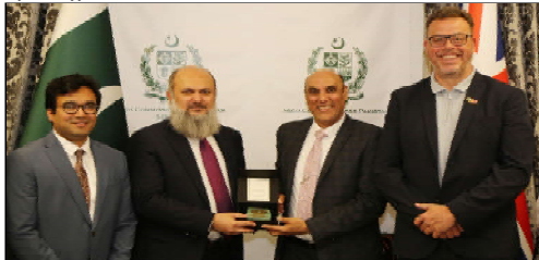
LONDON: Federal Minister for Commerce, Jam Kamal Khan, presents a souvenir to member of the Pakistan British Business Council during a meeting. The meeting focused on the Council's initiatives for trade matching, SME growth, women entrepreneurship, and strengthening bilateral business cooperation.