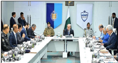
ISLAMABAD: Prime Minister Muhammad Shehbaz Sharif chairs a meeting regarding security arrangements for Chinese citizens in Pakistan.