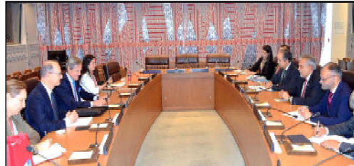
ISLAMABAD: Deputy Prime Minister and Foreign Minister, Senator Muhammad Ishaq Dar, met with the Special Envoy for Global Affairs of the Austrian Chancellor, Peter Lamusky, on the sidelines of the High-Level Political Forum (HLPF) on Sustainable Development.

According to NDMA's report, in the past 24 hours, 25 houses were destroyed, and five livestock were killed, raising the number of deaths to 200.