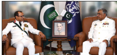
ISLAMABAD: Chief of the Naval Staff, Royal Saudi Naval Forces, Vice Admiral Mohammed Bin Abdulrahman Al Ghuraybi called on Chief of the Naval Staff Admiral Naveed Ashraf at Naval Headquarters.