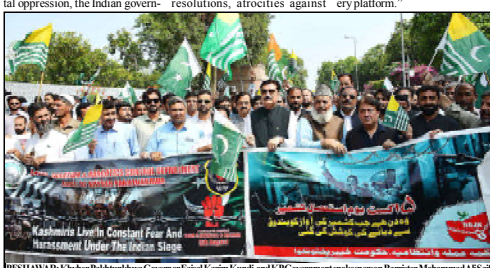
PESHAWAR: Khyber Pakhtunkhwa Governor Faisal Karim Kundi and KP Government spokesperson Barrister Muhammad Ahsan leading a rally to express solidarity with Kashmiris on Kashmiri Exploitation Day at Governor house.

He further said that when fascist India realized that the Kashmiri people remained steadfast in their struggle despite all forms of brutality and oppression, the Indian government