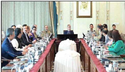
ISLAMABAD: Prime Minister Muhammad Shehbaz Sharif chairs a meeting of steering committee of Small and Medium Enterprises Development Authority.

has gone to extreme lengths to deprive the Kashmiri people of their fundamental right to self-determination.