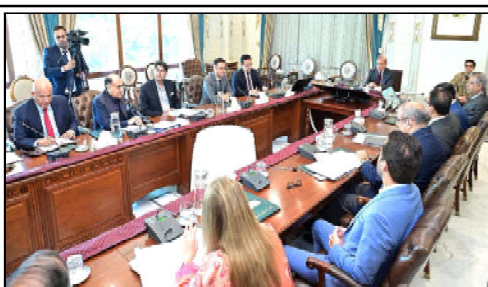
ISLAMABAD: Prime Minister Muhammad Shehbaz Sharif chairs a meeting to review progress regarding Jinnah Medical Complex.