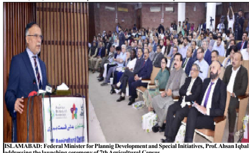
ISLAMABAD: Federal Minister for Planning Development and Special Initiatives, Prof. Ahsan Iqbal addressing the launching ceremony of 7th Agricultural Census.

All petitions have been submitted to the Peshawar High Court, with urgent hearings requested.