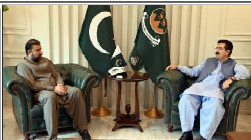
QUETTA: Member of Provincial Assembly Muhammad Sadiq Sanjrani meeting with Chief Minister Balochistan Mir Sarfaraz Bugti.