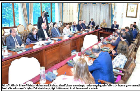
ISLAMABAD: Prime Minister Muhammad Shehbaz Sharif chairs a meeting to review ongoing relief efforts by federal government in flood affected areas of Khyber Pakhtunkhwa, Gilgit-Baltistan and Azad Jammu and Kashmir.