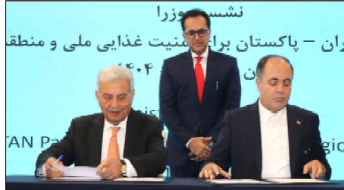
TEHRAN: Federal Minister for National Food Security & Research, witnessing the signing of landmark agreements on agricultural trade and cooperation between Pakistan and Iran in Tehran.

will prepare a layout for constructing different towers in the hospital. All roads leading to the hospital will be widened. "I want the Larkana hospital to be constructed and operational within two years," announces CM Sindh. Sindh CM directs Chief Secretary to form a committee, the Larkana Hospital Committee, to include P&D Chairman, Finance Secretary, and Health Secretary. "The committee must hire a consultant, finalize the hospital's design and initiate work immediately," Sindh CM instructs Chief Secretary to issue a notification for the hospital committee.