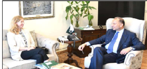
ISLAMABAD: Federal Minister for Climate Change Musadik Malik held a meeting with Laura Jalasjodi Country Representative of the Global Green Growth Initiative (GGGI).

ected districts of Gilgit-Baltistan. The Army Engineer's Corps and FWO are busy in opening roads that were blocked due to land sliding. The Islamabad-Gilgit Highway via Babusar Top has been reopened, while Hunza Road, which heads towards Estigun and China. Deosai Road, and Jaglot-Skardu Road, except Estigun Bridge, have also been reopened for traffic.