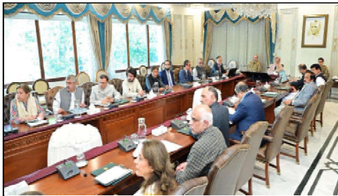
ISLAMABAD: Prime Minister Muhammad Shehbaz Sharif chairs a meeting to review relief operations during the torrential rains and floods.

lead to swift justice for citizens and a significant reduction in crime. The Sindh chief secretary also directed that any obstacles in the recruitment process of ASI investigation officers be promptly addressed. Speaking at the meeting, IG Sindh said that the recruitment will lead to higher quality investigations, adding: "Improved investigations will ensure timely justice and stronger action against criminal elements." Earlier, the Counter Terrorism Department (CTD) Sindh compiled a new edition of its "Grey Book," featuring profiles of 81 highly wanted suspects. According to authorities, Grey Book 2 includes details of individuals wanted in cases of murder, attempted murder, and kidnapping for ransom.