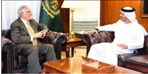
ISLAMABAD: UAE ambassador to Pakistan, Hamad Obaid Ibrahim Salem Al-Zaabi called on Deputy Prime Minister and Foreign Minister Senator Ishaq Dar.

heavy smoke drifting towards the Lines Area. The ground-plus-two building housed medical equipment shops in addition to the firecrackers warehouse. Authorities said flammable items, including oxygen cylinders, were being urgently removed to avert a larger catastrophe. Police surgeon Dr Summaiya Syed Tariq said that the number of injured persons reached 35. She added that 20 wounded persons were brought to Jinnah Hospital and 15 others were taken to Civil Hospital, while four of them were in critical condition.