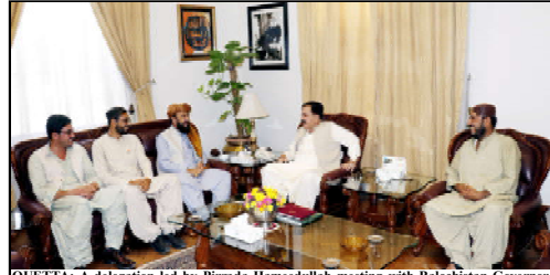
QUETTA: A delegation led by Pirzada Hameedullah meeting with Balochistan Governor Jafar Khan Mandokhail.

The dialogue will be co-chaired by Wang Yi and Deputy Prime Minister and Foreign Minister Ishaq Dar.