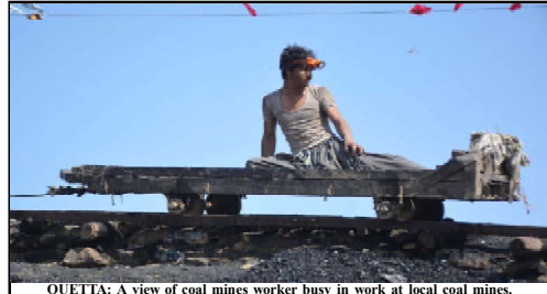
QUETTA: A view of coal mines worker busy in work at local coal mines.

There was a brief moment of nerves as Trump appeared to fumble the World Cup before placing it on his desk — as Infantino