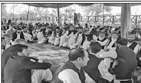
GILGIT-BALTISTAN: Chief Minister's Secretariat entered its sixth day on Saturday, as bar councils demanded immediate appointments of judges to the region's top and lower courts.