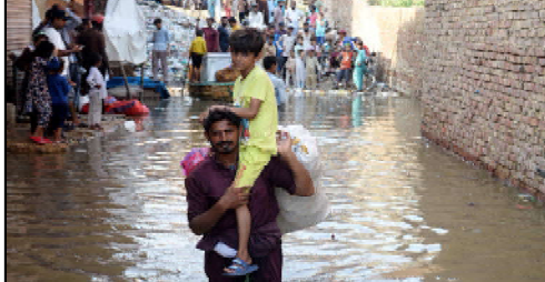
HYDERABAD: Families of Fatima Jinnah Colony, Latifabad unit No.11 are being shifted to safer places through makeshift arrangements as knee deep water was accumulated in the colony after rainfall.

He said that in Punjab at Ganda Singhwala on river Satluj, the PDMA was active to control the situation work in calamity-hit areas of KP and GB.