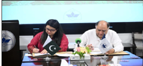
LAHORE: The Ministry of Information Technology and Telecommunication (MoITT) has signed a Memorandum of Understanding (MoU) with the Lahore University of Management Sciences (LUMS), through its Technology for People Initiative (TPI-LUMS), to strengthen digital governance and innovation in Pakistan.