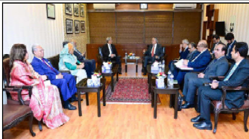
DHAKA: Deputy Prime Minister and Foreign Minister, Senator Mohammad Ishaq Dar, met with a delegation from the Bangladesh Nationalist Party (BNP), led by its Secretary General, Mirza Fakhrul Islam Alamgir.

Holding up a photo that he said Putin had sent him after their summit in Alaska last week, Trump said the Kremlin chief "wants to be there very badly," but that he "may be coming and he may not" depending on the outcome of Ukraine peace efforts.