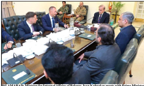
ISLAMABAD: Minister for Internal Affairs of Belarus Ivan Kurbakov meets with Prime Minister Muhammad Shehbaz Sharif.