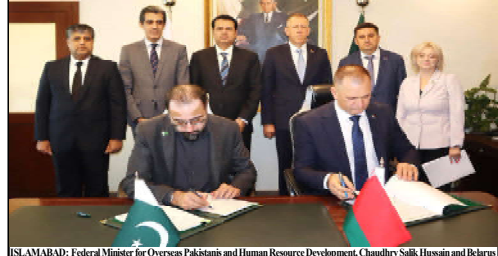
ISLAMABAD: Federal Minister for Overseas Pakistanis and Human Resource Development, Chaudhry Salik Hussain and Belarus Minister of Internal Affairs Ivan Kurbakov sign MoU regarding Cooperation in field of Labour and Empowerment.

Both nations have pledged to enhance collaboration and take concrete steps to root out terrorism for long-term regional peace and development.