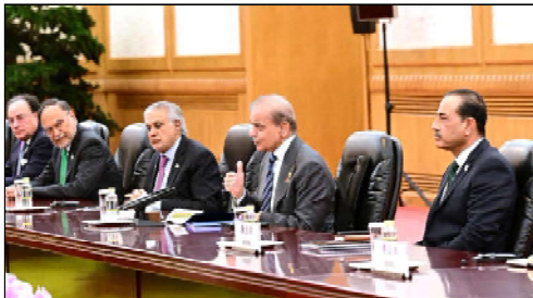
BEIJING: Prime Minister Muhammad Shehbaz Sharif meets with President of People's Republic of China Xi Jinping.