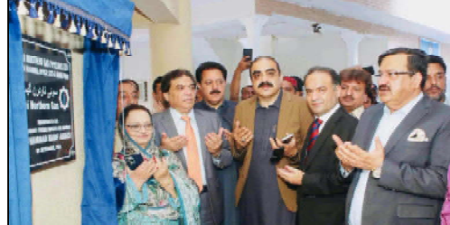
RAWALPINDI: Federal Minister Railways Muhammad Hanif Abbasi inaugurated Sui Gas Sub-Regional Office city, Rawalpindi. Bringing timely services to citizens' doorstep and advancing development under the Prime Minister's vision.

The IG of Khyber Pakhtunkhwa stated that a major attack on the FC in Bannu was successfully foiled, with five terrorists, including a suicide bomber, killed. He added that a significant terrorist plot was averted through timely action, and a search and clearance operation is underway in Bannu.