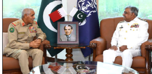
ISLAMABAD: Chief of Staff Bahrian Defence Force Lt General Theyab bin Saqr Al Nuaimi called on Chief of the Naval Staff Admiral Naveed Ashraf at Naval Headquarters.

The politician called for a unified national response to mitigate human suffering and property damage caused by devastating floods.