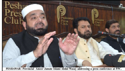
PESHAWAR: Provincial Ameer Jamate Islami Abdul Wasay addressing a press conference at PPC.

rounding areas have witnessed intermittent rainfall for the last 36 hours. The Met Office predicts the showers will continue until tomorrow. The city recorded a minimum temperature of 23°C, with humidity at 94% and winds blowing at 11 km per hour. In Karachi, partly cloudy skies are expected with light drizzle. The maximum temperature may rise to 33°C, while humidity remains above 70%. Winds from the southwest are blowing at 16 km per hour. Authorities across the country remain on alert as the ongoing rains raise fears of further flooding and infrastructure damage.