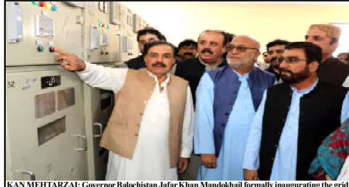
KAN MEHTARZAI: Governor Balochistan Jaffer Khan Mandokhail formally inaugurating the grid station at Kan Mehtarzai on the occasion of his one-day visit.

them that the state stood beside them in this difficult hour. President Zardari praised these efforts and reiterated that the people of Pakistan would not be left alone during this crisis. "Swollen rivers and unseasonal rains have created a looming threat of food insecurity across the region," President Zardari noted and pointed out that while Pakistan had played no role in creating the global climate catastrophe, but the nation continued to pay a heavy price for it.