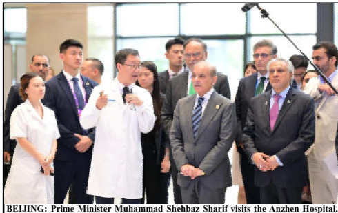
BEIJING: Prime Minister Muhammad Shehbaz Sharif visits the Anzhen Hospital.