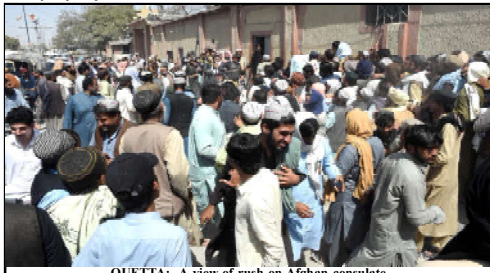
QUETTA: A view of rush on Afghan consulate.