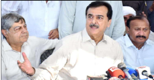
MULTAN: Chairman Senate Syed Yousuf Raza Gilani talking to media at Ghallio School, Jhok Wains where flood relief camps are established.

"Help the flood-affected people from your own pockets," He said, "I personally went to Sambrial in Sialkot yesterday. Wherever possible, we are helping flood victims. Our workers are present everywhere and making every effort."