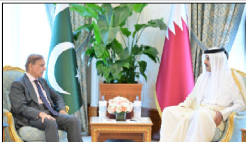
DOHA: Prime Minister Muhammad Shehbaz Sharif meets Amir of Qatar His Highness Sheikh Tamim bin Hamad Al Thani in Doha, Qatar.