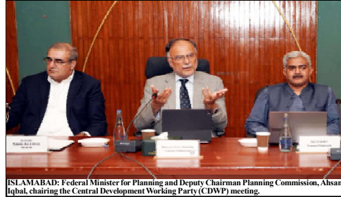
ISLAMABAD: Federal Minister for Planning and Deputy Chairman Planning Commission, Ahsan Iqbal, chairing the Central Development Working Party (CDWP) meeting.

Both sides reaffirmed their commitment to strengthening cooperation in climate resilience, sustainable development, and food security.