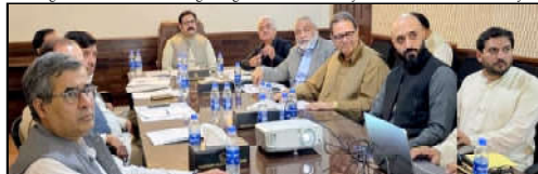
QUETTA: Provincial Health Minister Bakht Muhammad Kakar presides over a meeting of the Balochistan Healthcare Commission Board.

Meanwhile, IOJK Congress chief Tariq Hameed Karra described the PSA detention as a "direct attack on democracy."