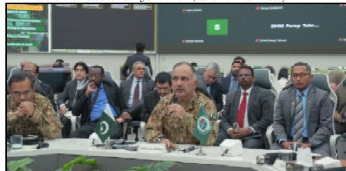
ISLAMABAD: NDMA conducted a monsoon appraisal briefing for delegation of Ambassadors of Foreign Countries at NEOC today.