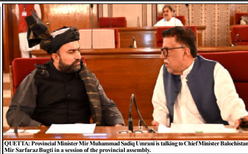
QUETTA: Provincial Minister Mir Muhammad Sadiq Umrani is talking to Chief Minister Balochistan Mir Sarfaraz Bugti in a session of the provincial assembly.

According to Bittani, the partnership would also promote agricultural modernization, organic food processing.