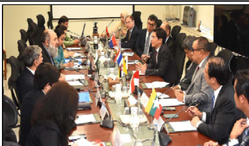
ISLAMABAD: Federal Minister for Commerce Jam Kamal Khan hosted Ambassadors of 07 ASEAN member states at the Ministry of Commerce.