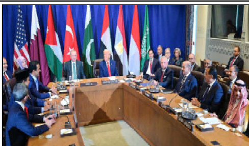
NEW YORK: Prime Minister Muhammad Shehbaz Sharif attends meeting of the Arab Islamic leaders hosted by The President of the United States Donald Trump and Emir of Qatar H.E. Sheikh Tamim Bin Hamad Al Thani.