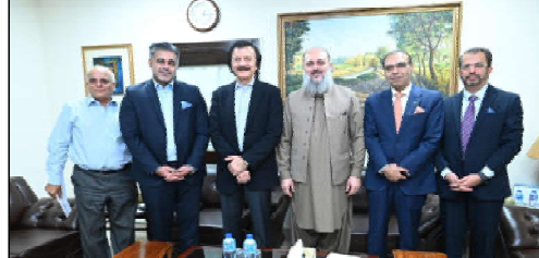
ISLAMABAD: Federal Minister for Commerce, Jam Kamal Khan, Special Assistant to the Prime Minister Haroon Akhtar Khan, with the delegation of Rawalpindi Chamber of Commerce & Industry (RCCI) led by its President, and members of All Pakistan Textile Mills Association (APTMA), after the policy consultation meeting.

Balochistan is also expected to remain mostly hot and humid, though Zhob and Musa Khel may witness isolated rain. In Kashmir, cloudy conditions with rain and thundershowers are likely, while Gilgit-Baltistan will remain partly cloudy and hot.