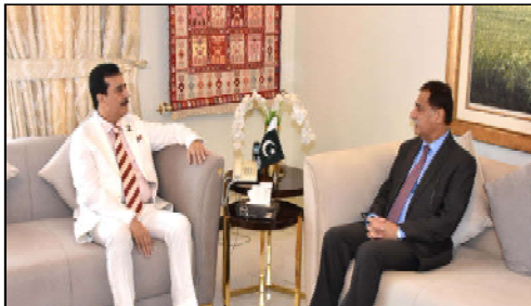
ISLAMABAD: Chairman Senate Syed Yousaf Raza Gilani in a meeting with Speaker National Assembly Sardar Ayaz Sadiq at this Residence.