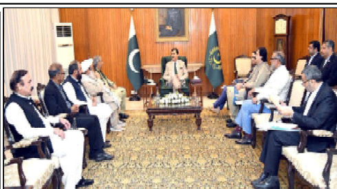
ISLAMABAD: Acting President Syed Yousuf Raza Gilani interacting with senators from different political parties at Awan-e-Sadr.