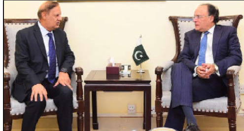
ISLAMABAD: Maqbool Ahmad Gondal, Auditor General of Pakistan paid a courtesy call on Senator Muhammad Aurangzeb, Federal Minister for Finance and Revenue following his assumption of office.

The visits reflect the growing regional solidarity among Central Asian countries and Pakistan in addressing shared challenges of natural disasters and climate change through collaboration and mutual support.