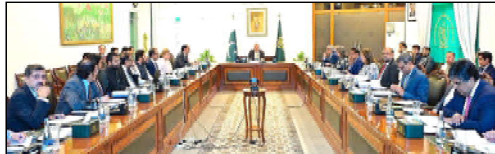
ISLAMABAD: Deputy Prime Minister and Foreign Minister Senator Muhammad Ishagh Dar chaired a meeting to review Pakistan's strategy for advancing trade and economic diplomacy.

On the sixth day of negotiations, IMF representatives are scheduled to receive a detailed briefing from Punjab government officials, sources confirmed.