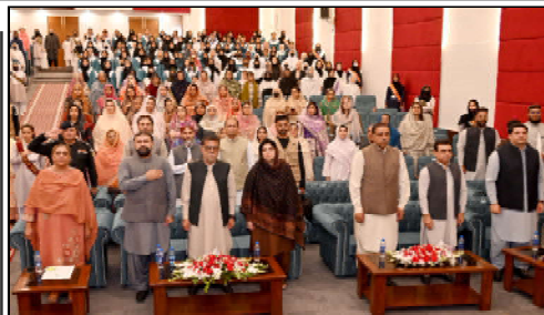
QUETTA: Chief Minister Balochistan Mir Sarfaraz Bugti and all participants stand in respect for the national anthem at the Government Girls College ceremony.