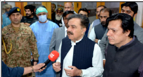
QUETTA: Governor Balochistan Jafar Khan Mandokhail talking to the media regarding the explosion near Pishin Sog FC headquarters.