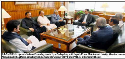
ISLAMABAD: Speaker National Assembly Sardar Ayaz Sadiq along with Deputy Prime Minister and Foreign Minister, Senator Muhammad Ishaq Dar in a meeting with Parliamentary leader of PPP and PML-N at Parliament house.