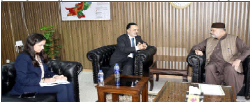
ISLAMABAD: Federal Minister for Poverty Alleviation and Social Safety, Syed Imran Ahmed Shah was called on by the Ambassador of Republic of Turkey İrfan Neziroğlu today to discuss possible Collaboration in Social Sector.

Reflecting on the Youth Development Index (YDI) 2021, Dr. Malik noted that limited availability of data posed significant challenges, leading to compromises in indicators and reliance on qualitative methods. With a stronger foundation now in place, the new PYDI will build on this progress.