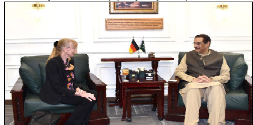
RAWALPINDI: H.E. Ms. Tina Lebel, Ambassador of Republic of Germany called on Muhammad Raza Hayat Harraj, Federal Minister for Defence Production at Rawalpindi.

offensive. The conflict was sparked by a Hamas attack on October 7, 2023, that killed around 1,200 people in Israel with 251 taken hostage. Israeli airstrikes and ground assaults have since devastated Gaza, killing more than 67,000 Palestinians, the enclave's health officials say. Progress towards a lasting peace now hinges on global commitments that may be taken up by a summit later on Monday or more than 20 world leaders led by Trump in Egypt's Sharm el-Sheikh resort. Much could still go wrong. Further steps in Trump's 20-point plan have yet to be agreed. Those include how the demolished Gaza Strip will be governed once fighting ends, and the ultimate fate of Hamas, which has rejected Israel's demands it disarm.