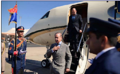
SHARM EL SHEIKH: Prime Minister Muhammad Shehbaz Sharif arrives in Sharm El Sheikh to attend Gaza Cessfire and Peace Summit. Dr. Ashraf Sobhy, Minister of Youth and Sports for Egypt received the Prime Minister upon his arrival.

The statement emphasized that "Pakistan will continue to take all possible actions to protect its people."