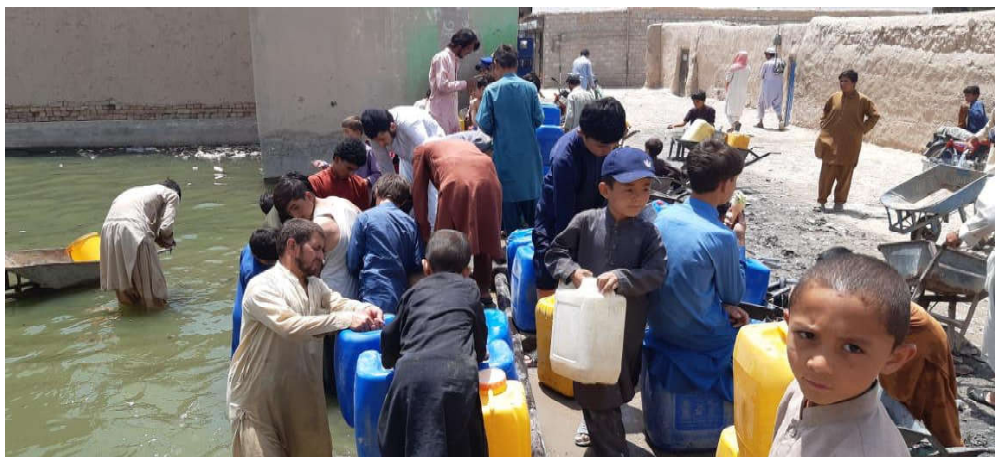
Children carrying water in the outskirts of Quetta

The situation demands an urgent and coordinated response—construction of small reservoirs, revival of karezes, investment in rainwater harvesting, and introduction of drought-resistant crops. Without sustainable planning,