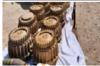
BALUCHISTAN Chaman: CTD Recovers Six Anti-Tank Mines... Page No 5