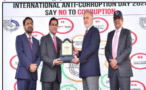
ISLAMABAD: Chairman NAB Lt Gen (R) Nazir Ahmed, giving shield to Speaker National Assembly Sardar Ayaz Sadiq during awareness walk with participants during an event marking International Anti-Corruption Day, organized by the NAB Islamabad-Rawalpindi at the Sports Complex.

The FBR chairman further stated that firm measures are also under way to curb the movement of smuggled goods.