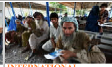
INTERNATIONAL Pressure mounts on German govt over Afghans... Page No 8