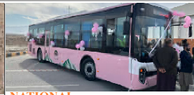
NATIONAL First Pink Bus Service Launched For Women In Balochistan, Bugti... Page No 3