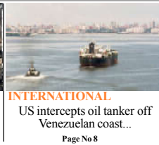
INTERNATIONAL US intercepts oil tanker off Venezuelan coast... Page No 8