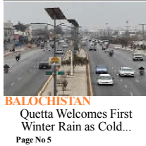
BALUCHISTAN Quetta Welcomes First Winter Rain as Cold... Page No 5