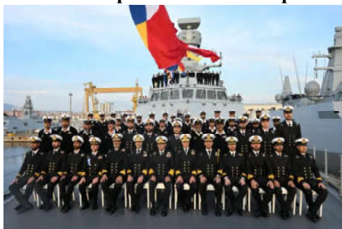
"The president further emphasised the need for enhanced mutual collaboration in the field of defence production in the fu-

According to the Inter-Services Public Relations (ISPR) statement, Erdogan "termed the brotherly relations between Pakistan and Türkiye as exemplary" while addressing the ceremony.