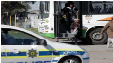
The wounded were taken to nearby hospitals, while the motive behind the attack remains under investigation. The incident marks the second major mass shooting reported in South Africa this month. Earlier, 12 people were

Police said the attackers continued firing as they fled the scene.