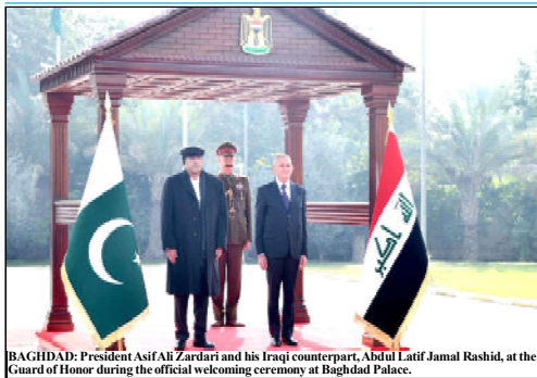
BAGHDAD: President Asif Ali Zardari and his Iraqi counterpart, Abdul Latif Jamal Rashid, at the Guard of Honor during the official welcoming ceremony at Baghdad Palace.

termed the scheme a revolutionary step toward the promotion of higher education. Students said the laptops would significantly help them in studies, research.