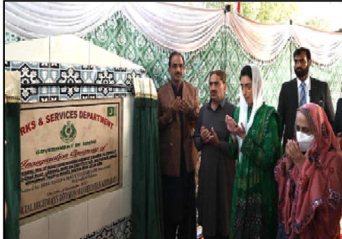
SHAHEED BENAZIRABAD: First Lady Aseefa Bhutto Zardari MNA, inaugurating the rehabilitation, improvement and expansion project of the road from Mehran Highway (Bandhli) to 60 mile 3-Chak Road (Karnal Mor).

Nawaz, Talal Chaudhry said that she was personally overseeing key sectors and taking timely decisions wherever required, whether in public transport projects or welfare initiatives. Referring to "Sutbra Punjab" programme, he said that the initiative had drawn attention even beyond Pakistan, noting that despite limited resources, visible cleanliness arrangements were present in villages across Punjab, reflecting effective governance. He said that over the past two years, development work had been initiated or completed in every village of the province while most major projects were launched during the PML-N tenures. He said that criticism and political rhetoric would continue, but the government remained focused on practical work and public welfare. He said that the teams led by Nawaz Sharif and Prime Minister Shehbaz Sharif had consistently prioritized national and provincial development. Addressing the para-veterinary staff, the state minister said that they were performing a noble duty by reaching every village to care for livestock, which plays a fundamental role in stabilizing the rural economy. He said that livestock services would be further strengthened to ensure doorstep facilities for the farmers and livestock owners, with the aim of making Punjab a model province in the livestock sector.