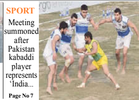
SPORT Meeting summoned after Pakistan kabaddi player represents India... Page No 7

First Digital, Print Daily of Balochistan