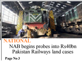
NATIONAL NAB begins probes into Rs40bn Pakistan Railways land cases Page No 3