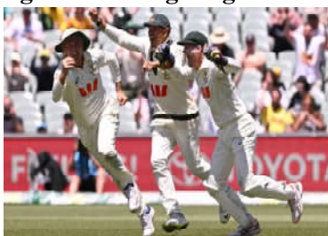
they lost spin wizard Nathan Lyon, who damaged his hamstring fielding and hobbled off after saving a boundary. But he was not needed as seamers Mitchell Starc, Cummins and Boland wrapped up the innings either side of lunch with the second new ball. Lyon was sent for scans and later seen on crutches, potentially putting him out of the Melbourne Test, starting Friday, and Sydney on January 4. "It doesn't look great. I don't know yet, but seeing someone on crutches doesn't really bode well for someone with a Test match a week away," said Cummins. "It's going to be hard to replace him but we have some guys who have already had a taste of international cricket around the traps." Cummins was playing his first Test since July after a long layoff with lower back issues and said he may well skip Melbourne as a precaution. "We'll wait and see. So we'll work on it over the next couple days. I doubt I'll be playing Melbourne, and then we'll have a chat about Sydney." England's demise in 11 days of play is the joint second quickest in more than a century, since the 1921 Ashes was completed in eight days with their "Bazball" style of ultra-attacking cricket exposed. "That dream is now over, which is incredibly disappointing," said England skipper Ben Stokes. "Everyone is hurting and quite emotional about it. It hurts, it sucks, but we ain't going to stop." Stokes also took some positives from the way England battled, having demanded more fight leading into the match. "That stuff I wanted to see, I've seen that this week. I think we can take a lot from this game," he said. "We have got so much to play for, and we will be flying into these next two games." England's capitulation over three Tests is a far cry from the pre-Ashes hype where they were touted as having their best chance in a generation to win a series in Australia. And it made a mockery of former fast bowler Stuart Broad's claim that the hosts had their weakest side in 15 years, written off by others as a "Dad's Army".

NEWS DESK: Australia captain Pat Cummins said it felt "pretty awesome" Sunday after his dominant team won the third Test in Adelaide to wrap up the Ashes in just 11 days of play after some dogged resistance from England's tail briefly threatened a great escape. England's last four wickets added 145 on the final day to be all out for 352 and lose by 82 runs after finally showing some fight in the series as they chased a record 435 to win. Australia's Scott Boland removed last man Josh Tongue, caught by Marnus Labuschagne, to spark wild celebrations as the famous urn remained in Australian hands. "It feels pretty awesome," said Australia captain Pat Cummins. "It wasn't easy today, but we got it done. The last two months have been a bit of a grind," he added. "But it's all worth it for days like this. That's when we are at our best... it's good old-fashioned grind, and I love the toll from all the guys." England had to win to keep the five-match series alive after being crushed by eight wickets inside two days at Perth and in four at Brisbane, with two more Tests still to play at Melbourne and Sydney. Australia had one setback on Sunday when