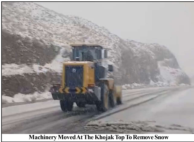
Machinery Moved At The Khojak Top To Remove Snow