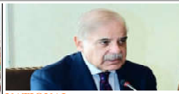
NATIONAL Shehbaz open to talks with PTI but rejects 'illegal demands or black- Page No 5