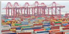
BUSINESS Leveraging US tariffs can lift Pakistan's exports Page No 4