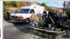
INTERNATIONAL Three killed in Israeli strike on vehicle in Lebanon Page No 6

First Digital, Print Daily of Balochistan