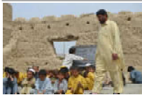
EDITORIAL Balochistan's Education Crisis: Beyond Numbers... Page No 2